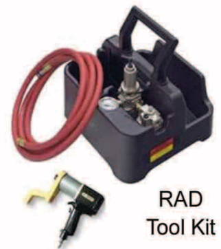
RAD Tool Kit